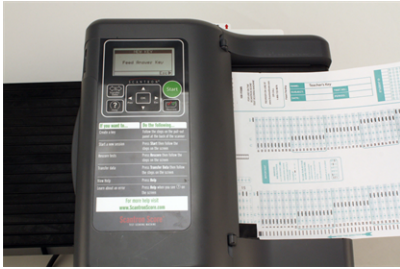
5. Scan the key.