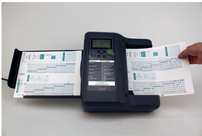
6. Scan the tests.