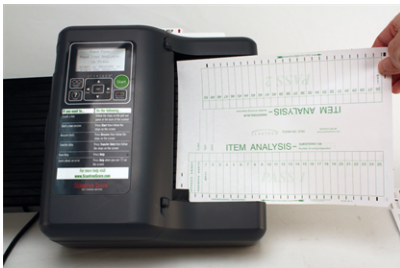
7. Scan an item analysis form to analyze the test results.

Order Forms & Supplies 800.722.6876 www.scantronstore.com